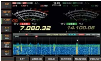
Spectrum scope with waterfall

The spectrum waterfall function can show the changing amplitude of frequency spectrum over time. A weak signal which cannot be recognized with the spectrum scope may be found in the waterfall screen. When used in combination with spectrum and waterfall screens, you can observe detailed band activity by other stations. The wide screen setting emphasizes the signal strength in the spectrum scope and shows a longer period for the waterfall.