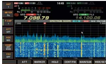
Spectrum scope with waterfall (wide screen setting)