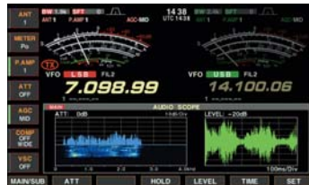
Audio scope (FFT scope with waterfall and oscilloscope)