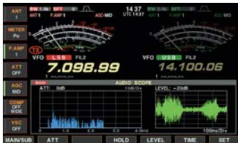
Audio scope (FFT scope and oscilloscope)

* Transmitting audio can be shown on voice modulation modes only. The transmit quality monitor function must be ON for monitoring the transmitting audio.