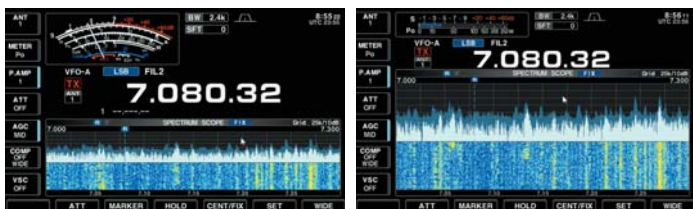
Spectrum scope with waterfall

The spectrum waterfall function can show the changing amplitude of frequency spectrum over time. A weak signal which cannot be recognized with the spectrum scope may be found in the waterfall screen. With the high performance receiver, the IC-7700 increases your chances of making QSOs. When used in combination with spectrum and waterfall screens, you can observe detailed band activity by other stations.