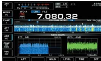
Mini spectrum scope and audio scope