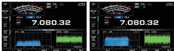
Audio scope (FFT scope and oscilloscope)

* Transmitting audio can be shown on voice modulation modes only. The transmit quality monitor function must be ON to monitor the transmitting audio.