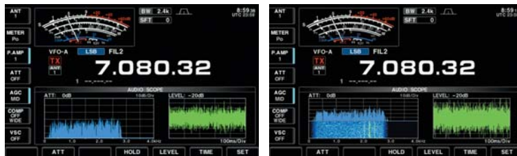
Audio scope (FFT scope and oscilloscope)

* Transmitting audio can be shown on voice modulation modes only. The transmit quality monitor function must be ON to monitor the transmitting audio.