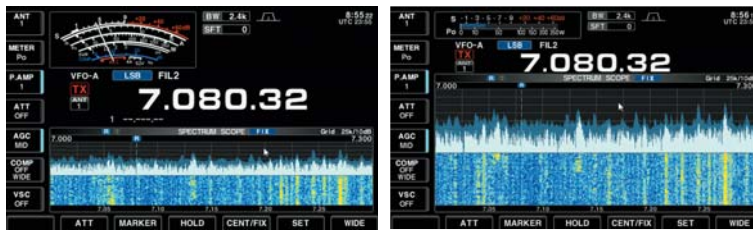
Spectrum scope with waterfall

The spectrum waterfall function can show the changing amplitude of frequency spectrum over time. A weak signal which cannot be recognized with the spectrum scope may be found in the waterfall screen. With the high performance receiver, the IC-7700 increases your chances of making QSOs. When used in combination with spectrum and waterfall screens, you can observe detailed band activity by other stations.