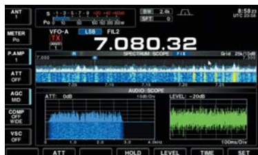
Mini spectrum scope and audio scope